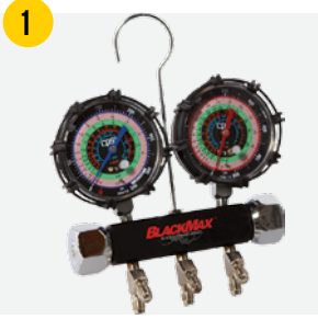
Two Valve Service Manifold (Varies by kit. See chart below) R-410A/R-22/R404A gauges