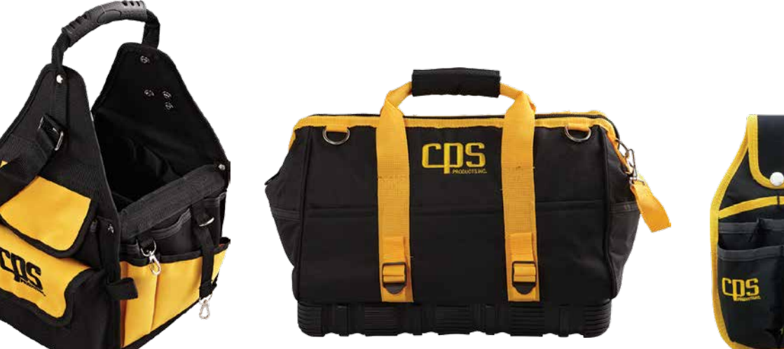
TLBAG1 Square Tool Organizer

Organize your tools with care with this extra strong, premium built series of tool bags from CPS.